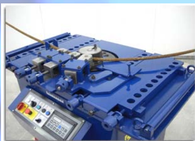
B-HD SERIES With spiral equipment