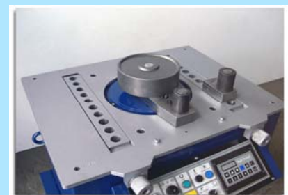
B-ST SERIES With big radius bending fittings