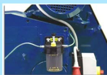
Central lubrication pump