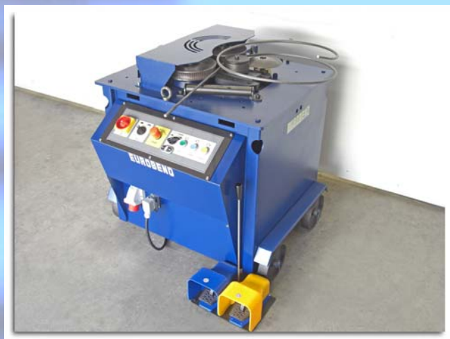
SP 35 SERIES