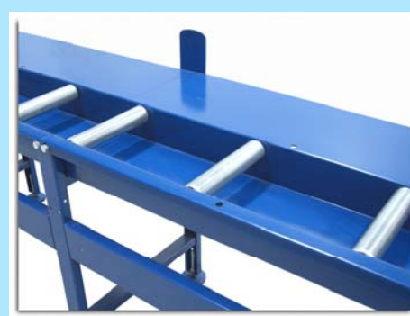
DS-ST 411 SERIES