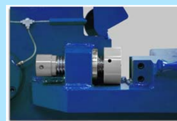
Backstop adjustment screw