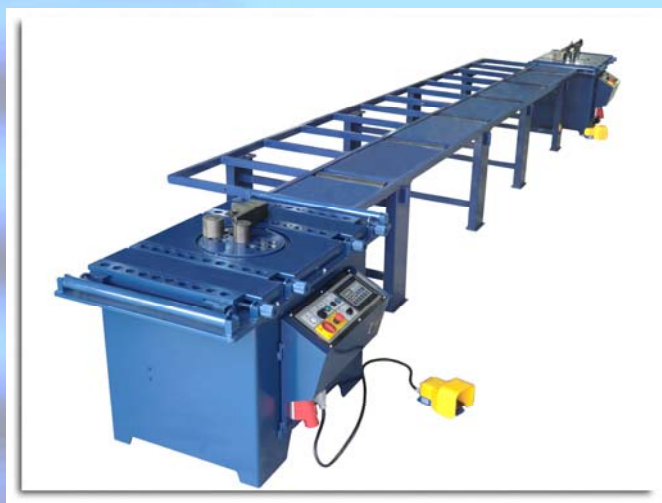
DS-HD 410 SERIES