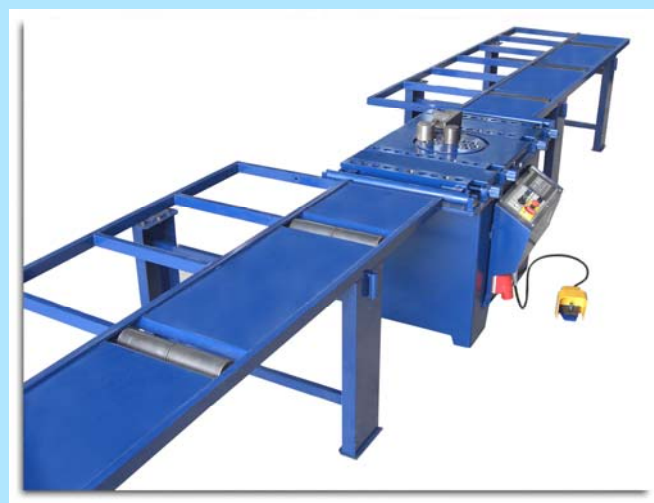
DS-HD 410 SERIES