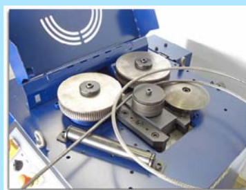
B-SP 35 SERIES