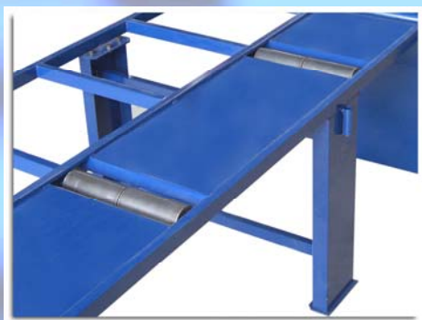
DS-HD 410 SERIES