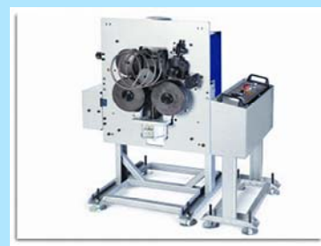
B-SP 35 TILT SERIES