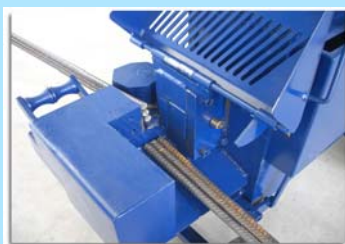
Easy replaceable cutting blades