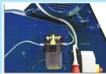
Central lubrication pump