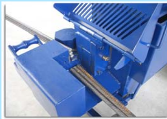
Easy replaceable cutting blades